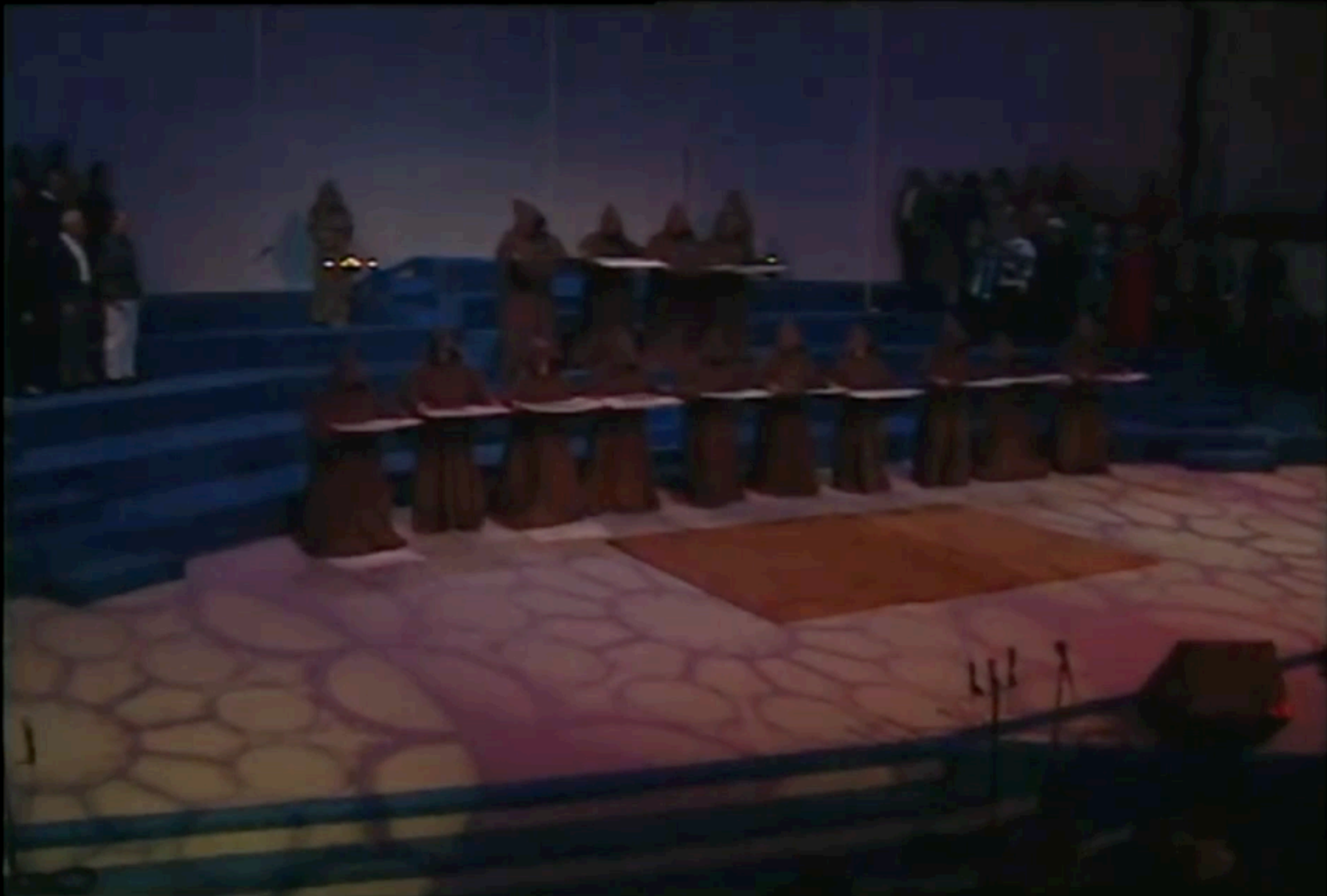
Handel's Messiah: Hallelujah Chorus by the Hallelujah Monks